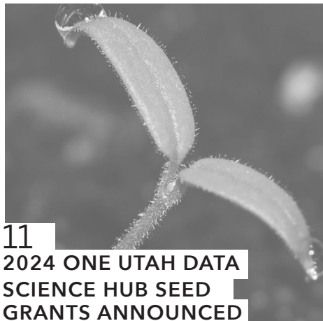
11 2024 ONE UTAH DATA SCIENCE HUB SEED GRANTS ANNOUNCED