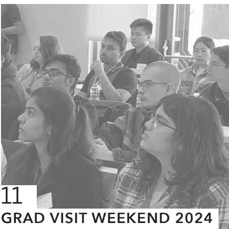
11 GRAD VISIT WEEKEND 2024