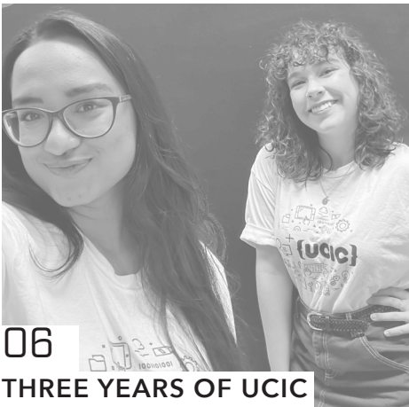
06 THREE YEARS OF UCIC