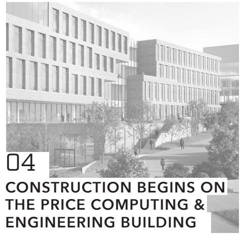
04 CONSTRUCTION BEGINS ON THE PRICE COMPUTING & ENGINEERING BUILDING