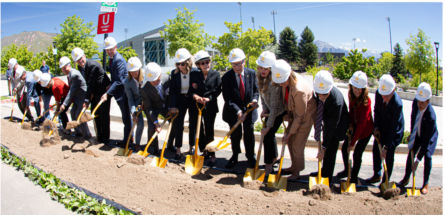
Above: Groundbreaking of the Price Computing and Engineering Building.

A beautiful event space on the fifth floor overlooking both downtown and the Salt Lake Valley and a 400-person auditorium on the first floor will make possible sponsoring conferences and workshops that will regularly bring visitors to our beautiful campus.