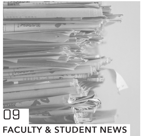
09 FACULTY & STUDENT NEWS