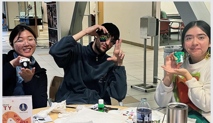
Above: Students gather at a UCIC social event.

A simplified, more transparent process to becoming a computing major eliminates obstacles without lowering standards.